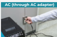
AC (through AC adapter)

Also can be powered by the combination of one XGT battery and one LXT battery