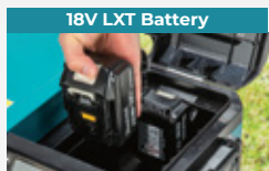
18V LXT Battery