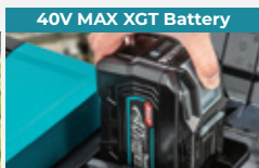
40V MAX XGT Battery