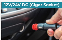
12V/24V DC (Cigar Socket)