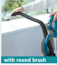
with round brush