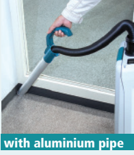
with aluminium pipe