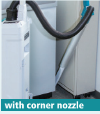
with corner nozzle

by using aluminium pipe with expandable hose and attachments