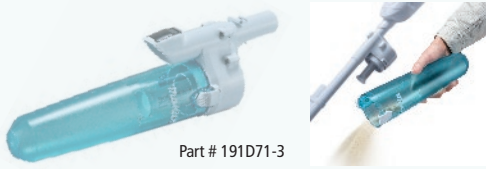
Part # 191D71-3