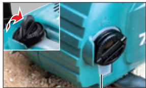
Chain Oil Level Window