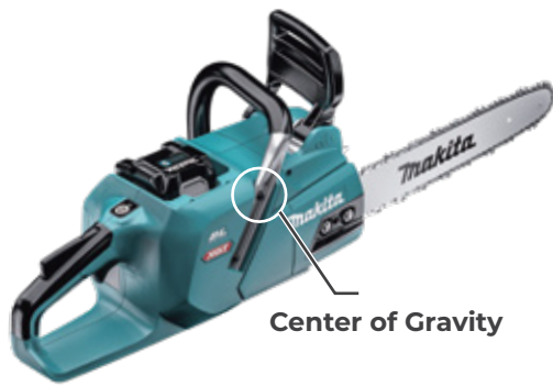
Center of Gravity