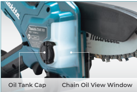
Oil Tank Cap Chain Oil View Window